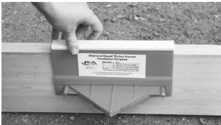
Diamond Dowel® installation template