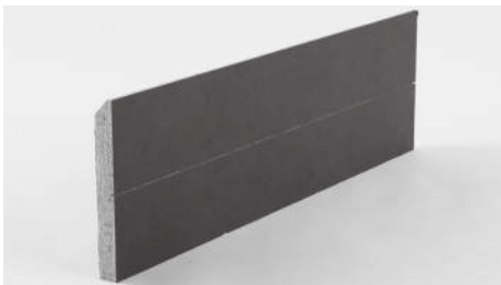
Diamond Dowel® bulkhead