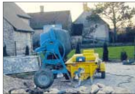
S8 SMART with a cement mixer