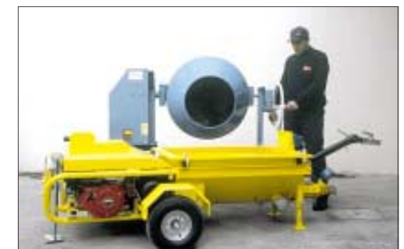
Low filling height