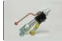
Spray gun for viscous materials