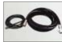
Mortar and air hoses with couplings