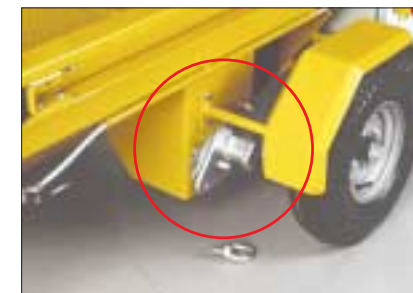
Lowered working position