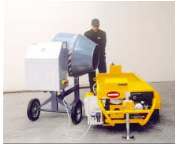
Mixer powered by the S8 SMART