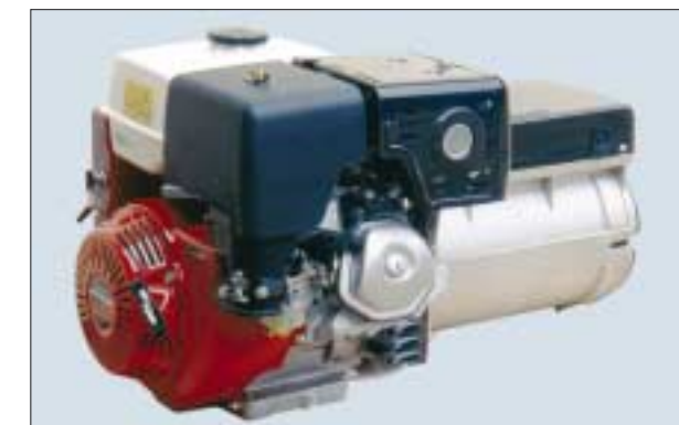
Powerfull 8kVA integrated electric generator