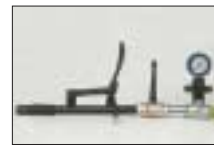
Injection gun with pressure gauge