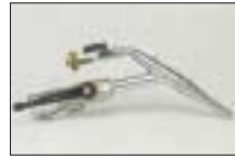
Spray gun for filling joints