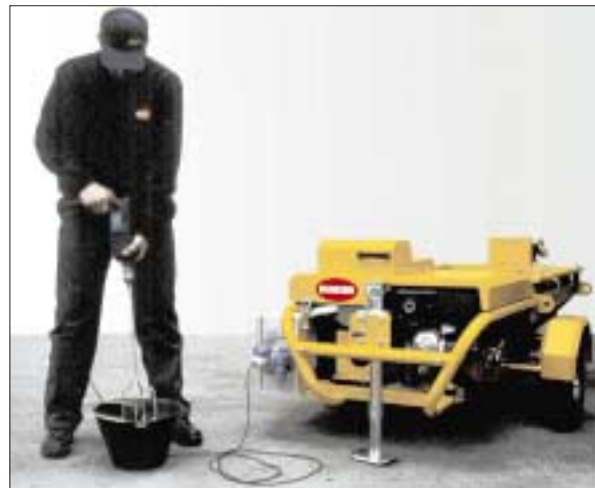
The S8 SMART powering a drill for the preparation of mortar