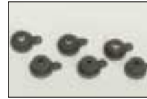
Rubber mortar nozzles