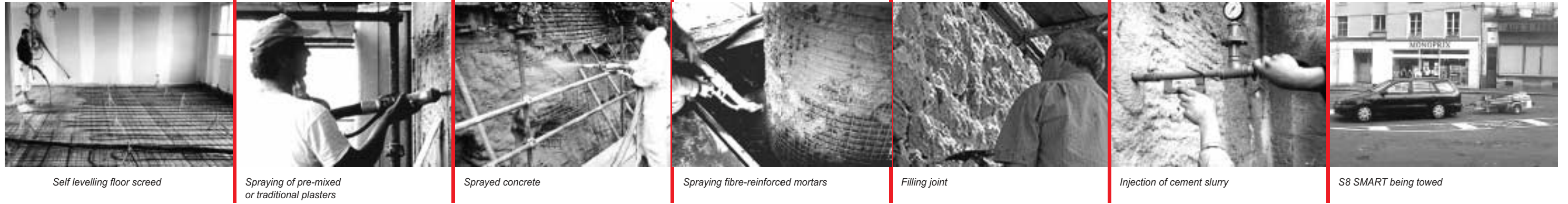
Self levelling floor screed