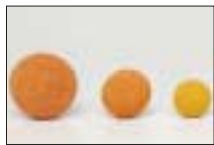
Sponge balls for hose cleaning