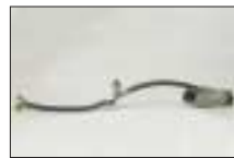
Standard spray gun