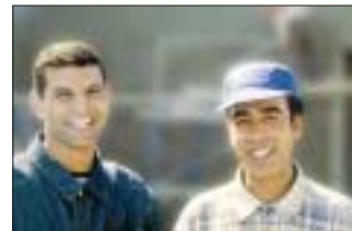
The S8 SMART satisfied all our requirements. It is an innovative and easy to use plastering machine.

Bunker proves once again to pay close attention to the markets' evolution. Its new S8 SMART confirms in fact just how much care it dedicated to listening to the markets' new needs by creating an innovative plastering machine of undeniable interest, which contributes to the satisfaction and the convenience of its users.