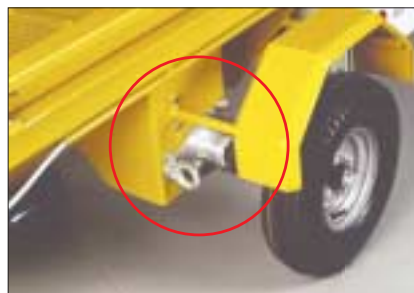
High position for transport