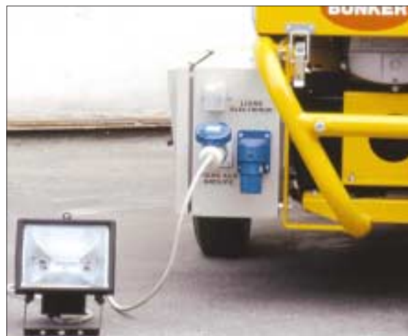
Powering a halogene lamp