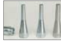
Nozzles for filling joints