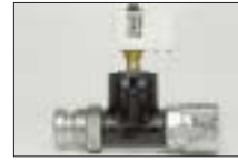
Pressure switch with T-piece