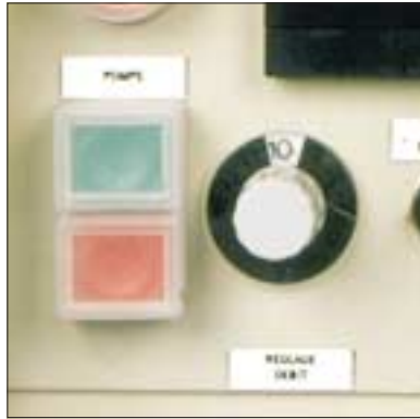
It is possible to vary the output by rotating this knob